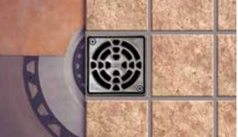
Schluter®-KERDI-DRAIN assembly with Schluter®-KERDI waterproofing membrane.

Procedure E at 90% relative humidity. KERDI-DS is 20-mil thick and features additives to produce a water vapor permeance of 0.19 perms.